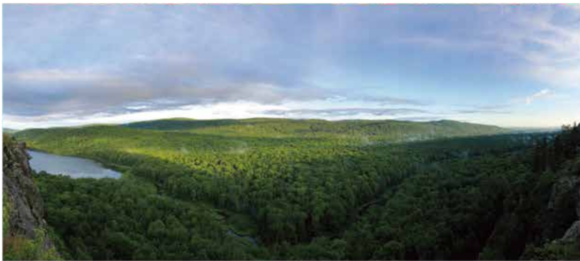
Projector is zoomed to fill the screen for scope content

Finally, your projector lens can now always remain in same position, regardless of the movie AR, thanks to Envy's instant AR handling. This works even when the AR changes within the same movie, as shown below.