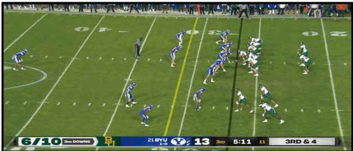
With Envy: Image fills the entire screen, taking your immersion to a whole new level!