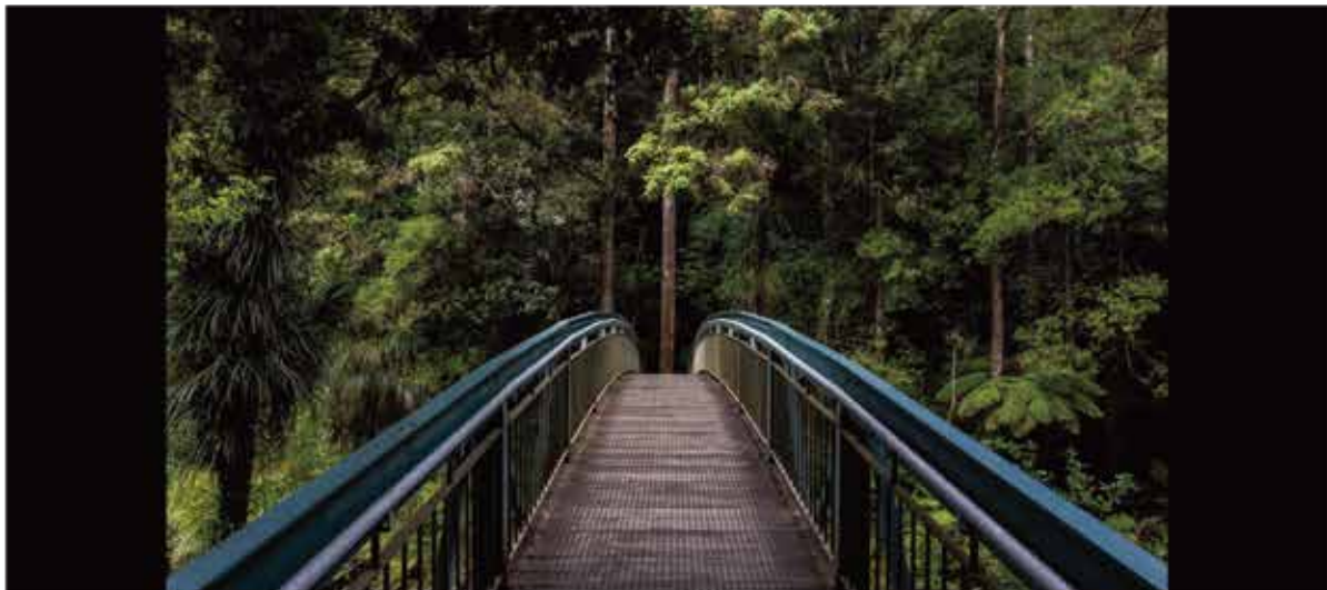
Envy still perfectly fits 16:9 content, without changing the lens zoom!