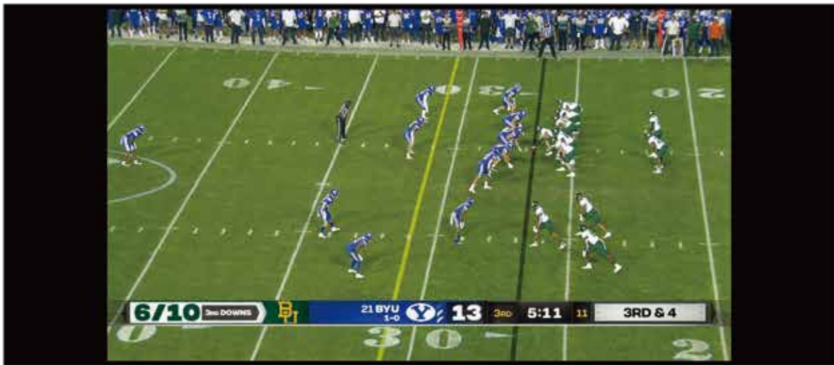
Without Envy: Original 16:9 image with pesky black bars

Envy can fit any aspect ratio image to fill any aspect ratio screen, removing those pesky black bars once and for all! Our non-linear stretch uses both horizontal expansion and vertical compression - an industry first! NLS takes your level of immersion to new heights!